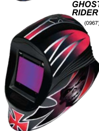
GHOST RIDER (0967)