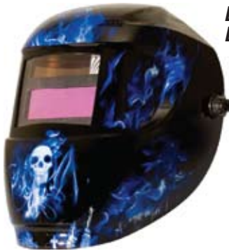
BLUE DOOM (0141)