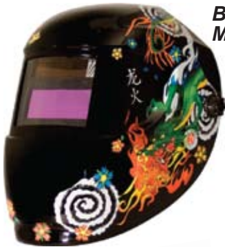
BLACK MAGIC (0169)