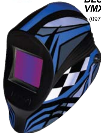
BLUE VMX (0971)