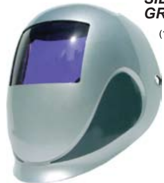
SILVER/ GREY (1185)