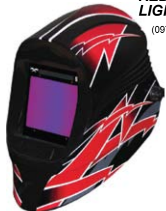
RED LIGHTNING (0974)