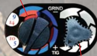
Sensitivity Adjustment (where applicable)