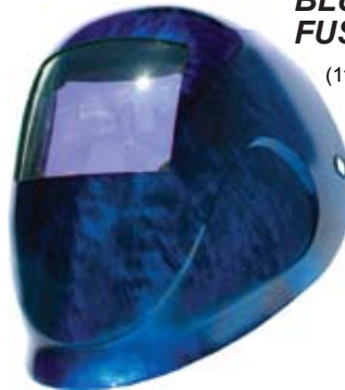
BLUE FUSION (1144)