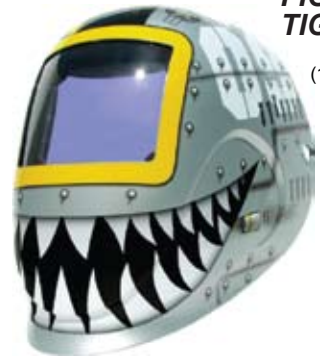
FIGHTING TIGER (1171)