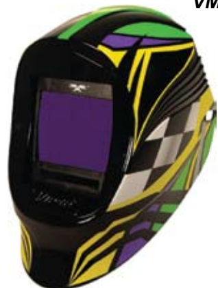
YELLOW VMX (0970)