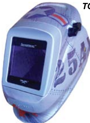
TOP GUN (0566)