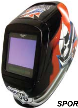
EASY RIDER (0568)