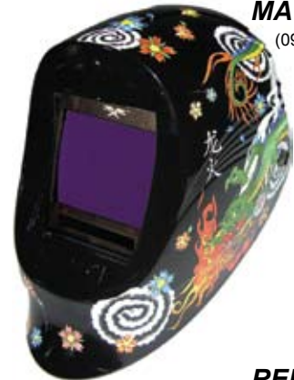
BLACK MAGIC (0969)