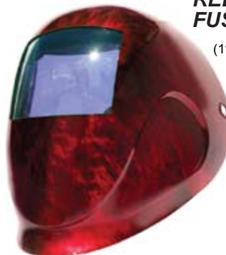
RED FUSION (1124)