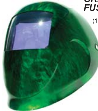
GREEN FUSION (1154)