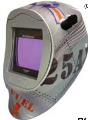
TOP GUN (0966)