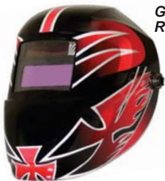
GHOST RIDER (0167)